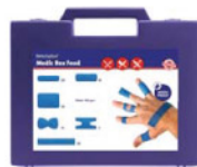
HACCP Washproof CD-9011