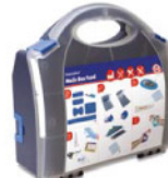
Large Size CD-9030